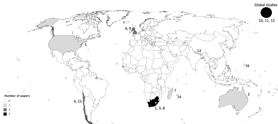
Figure 1: The geographical distribution of contributions to the special issue on “ Human and Social Dimensions in Invasion Science ”. Numbers refer to papers listed in Table 1 which provides further details of each study.